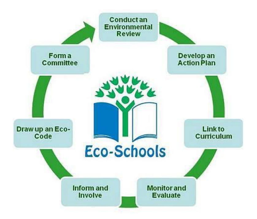
Seven steps to become an Eco-school (http://www.ecoschools.org/menu/process/seven-step)

The Eco-Code is a mission statement. It should demonstrate in a clear and imaginative way, the school's commitment to improving its environmental performance. It should be memorable and familiar to everyone in the school.