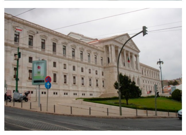
Typical government buildings.

The fact that energy saving measures are seldom applied when government buildings are retrofitted reveals that in many cases, decision makers simply lack knowledge of the many energy saving measures available to them, and of the efficiencies and return on investments that