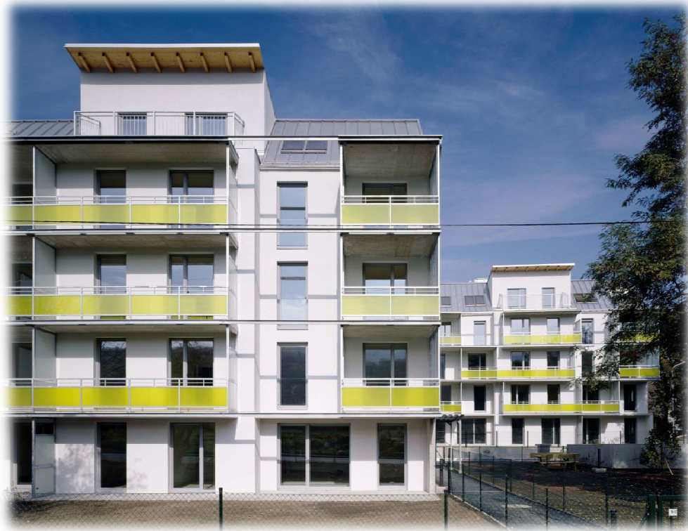
Figure 5: Vienna Utendorfsgasse Passivhaus Apartment Building.

The challenge of this project was to build high-performance social housing with a very limited budget. Careful design to solve problems like thermal bridging and fire breaks on a small budget was required.