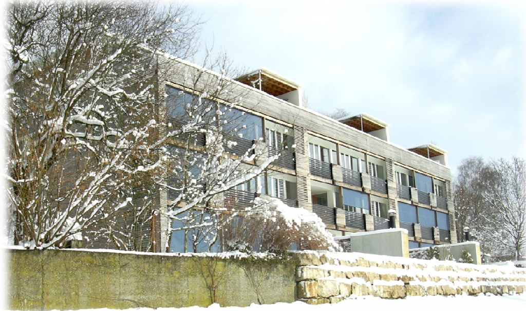
Figure 4: Sunny Woods Apartment Building, Zurich.

Prize-winning architectural design went hand in hand with ultra low energy performance for this development. Evacuated tube solar collectors were integrated in the façades as balcony balustrades, large windows maximised passive solar and daylight gains, and a photovoltaic roof completed the aesthetic appeal of the project.