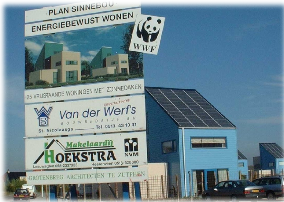
Figure 6: The WWF Endorsement.

The WWF housing project is a good example of using mutually beneficial alliances in a marketing campaign. In this project, three parties worked together to achieve a profitable situation for all parties.