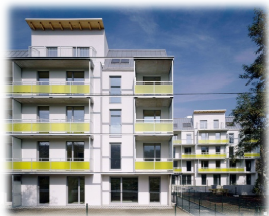
Figure 1: 4000 high performance houses already have owners in Europe, and the industry is expanding. The project's goal was to accelerate this expansion by optimising the mix of technologies for maximum economy. For further information on the photographs and the houses shown, see page 16.