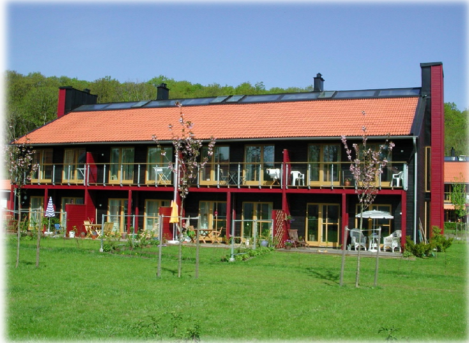
Figure 3: The Lindås Passive House Project in Goteborg, Sweden.

These are impressive because they achieve high-performance in a cold northern climate with long winter nights. Also of note is the courage of the client and architect in building a whole estate of row houses. Solar hot water heating is used successfully despite the short and overcast days for six months of the year in Sweden, offset by six months of long days and sunshine.