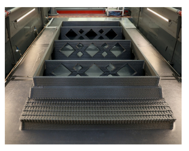
A 3D-printed mold used for manufacturing precast concrete façade panels at the redeveloped former Domino Sugar Refinery in Brooklyn, New York.

Our other principal initiative, Advanced Building Construction, is trying to tackle two stubborn, related problems in our field: The first of these is how to increase the use of energy efficiency retrofits in existing