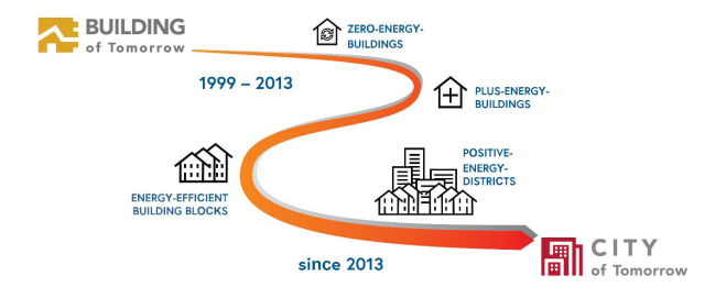
From zero energy buildings to positive-energy districts within the Building of Tomorrow programme.

In the past, Austria has been very successful in: developing funding programmes and instruments tailored to thematic challenges and needs; actively participating in European and international collaboration initiatives; adapting to changing research and innovation landscapes. In the future, it will not only be important to strengthen the advantage of Austria's innovation potential, but also to push the development and implementation of innovative energy solutions and