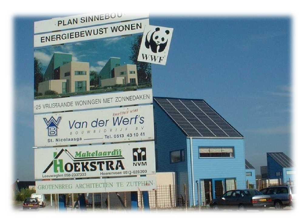
Figure 6: The WWF Endorsement.

The WWF housing project is a good example of using mutually beneficial alliances in a marketing campaign. In this project, three parties worked together to achieve a profitable situation for all parties.