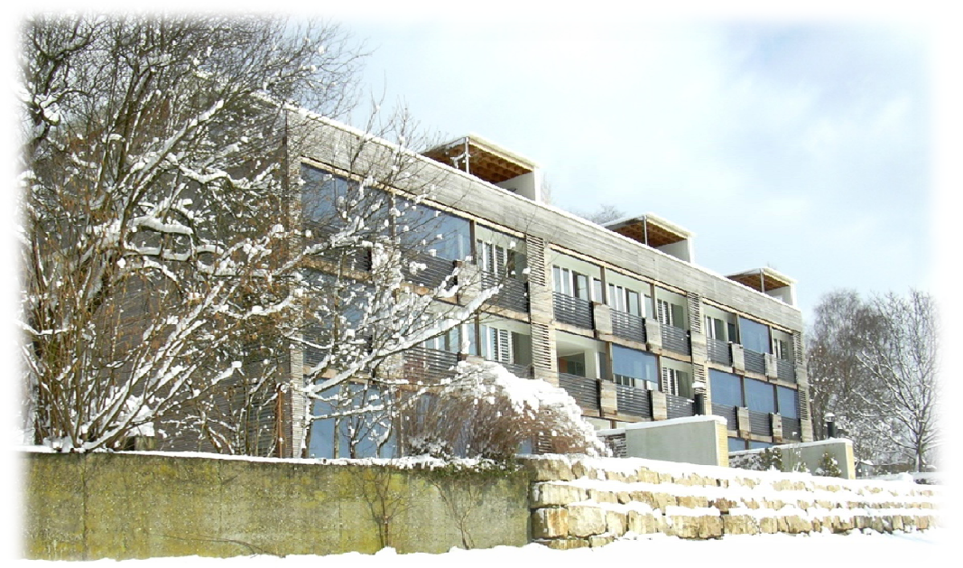
Figure 4: Sunny Woods Apartment Building, Zurich.

Prize-winning architectural design went hand in hand with ultra low energy performance for this development. Evacuated tube solar collectors were integrated in the façades as balcony balustrades, large windows maximised passive solar and daylight gains, and a photovoltaic roof completed the aesthetic appeal of the project.