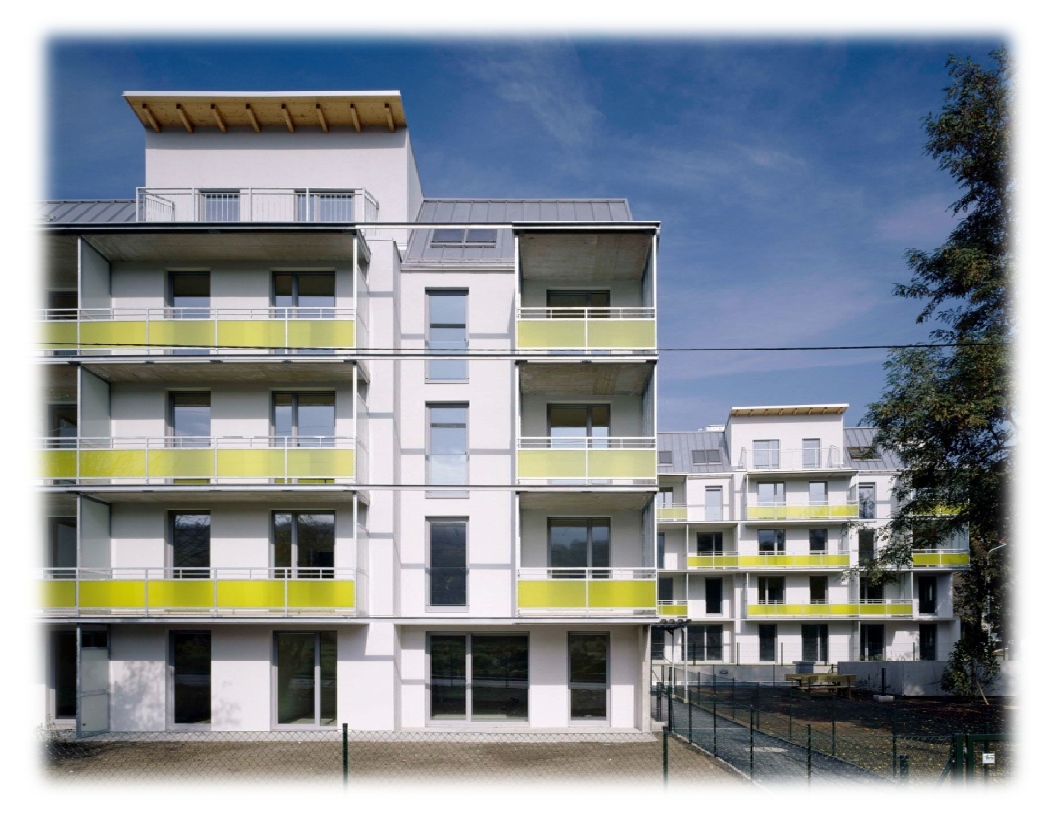
Figure 5: Vienna Utendorfgasse Passivhaus Apartment Building.

The challenge of this project was to build high-performance social housing with a very limited budget. Careful design to solve problems like thermal bridging and fire breaks on a small budget was required.