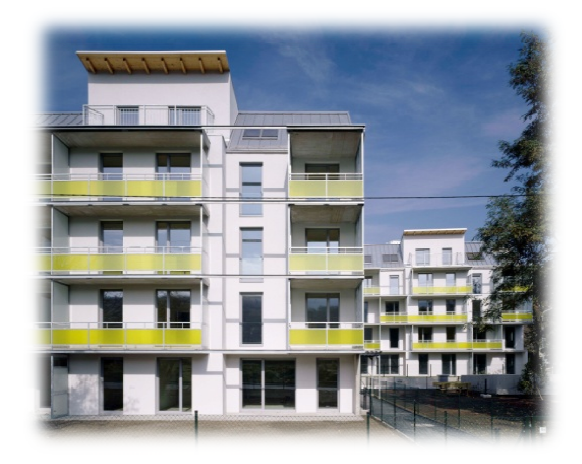
Figure 1: 4000 high performance houses already have owners in Europe, and the industry is expanding. The project's goal was to accelerate this expansion by optimising the mix of technologies for maximum economy. For further information on the photographs and the houses shown, see page 16.