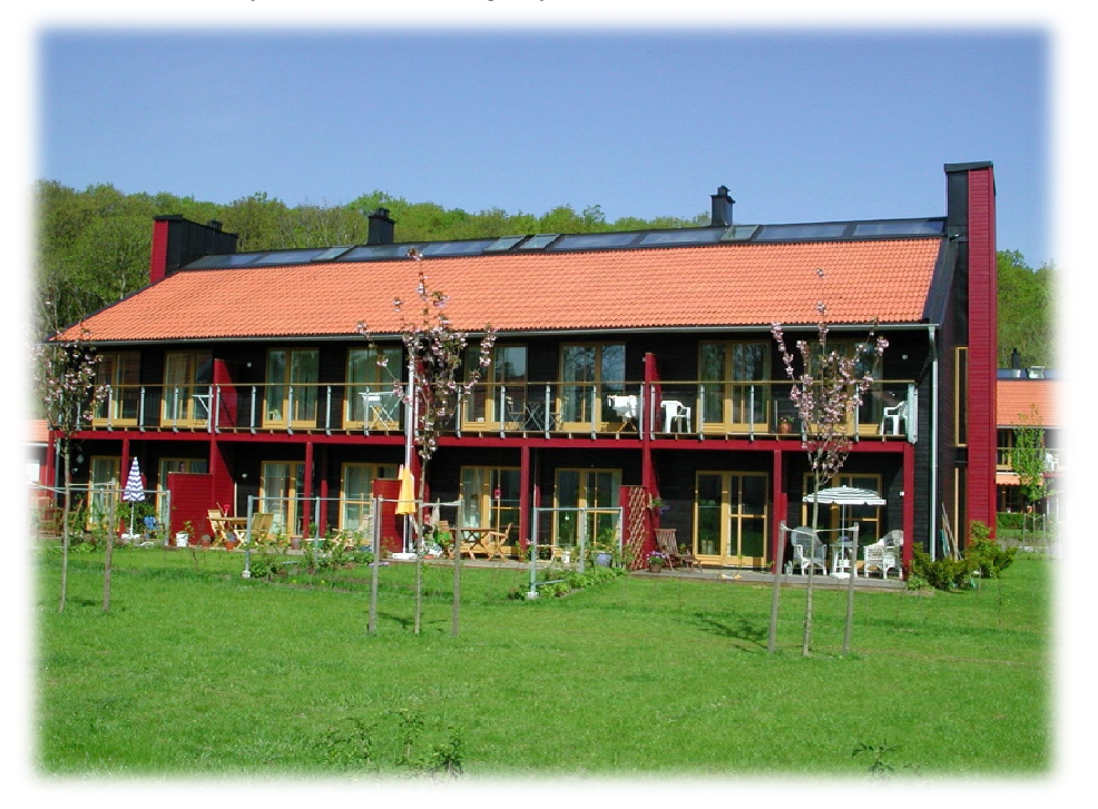
Figure 3: The Lindås Passive House Project in Goteborg, Sweden.

These are impressive because they achieve high-performance in a cold northern climate with long winter nights. Also of note is the courage of the client and architect in building a whole estate of row houses. Solar hot water heating is used successfully despite the short and overcast days for six months of the year in Sweden, offset by six months of long days and sunshine.